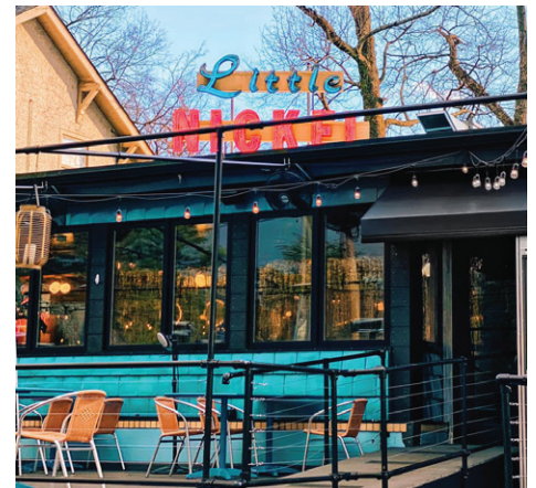
Little Nickel’s expanded patio

Just in time for summer, the ice cream shop, Charm School Study Hall, also recently opened at the Hill Standard and soon Stella’s Market will join the new center’s lineup.