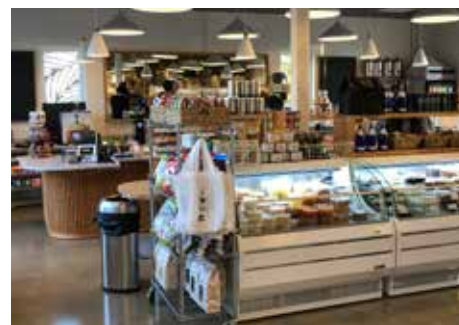
Stella's Market opened the week of November 8th