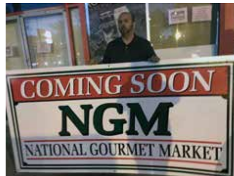
NGM Market hopes to open in mid-December