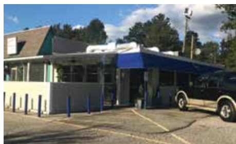
Riverside Tavern, freshly renovated, added a fantastic patio and a great menu.

Stella's Market has been a long awaited addition to the neighborhood. It and its other locations bring a popular selection of freshly prepared and prepacked foods that will make weeknight dinner planning (or the lack thereof) a lot easier for many families. You can also get espresso drinks, craft beers and other gourmet nibbles to eat there or take home. ■