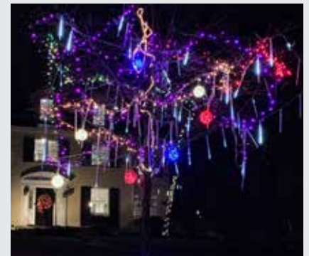
Last year's winner of the night time "Best Tree" award.

Results from judging will appear in the form of a WHNA special sign in the front year of the winners and pics in the winter issue of the RAG. We would like to encourage our neighbors to help us spread some holiday cheer by decorating the outside of your homes to brighten our neighborhood. ■